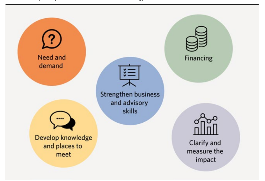
FIGURE 2. Five priority areas under the national strategy

Using the strategy, the Government is particularly seeking to develop the following five prioritised areas: